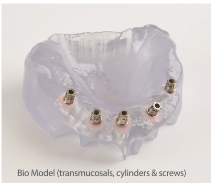
Bio Model (transmucosals, cylinders & screws)